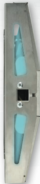
2.5" slim width