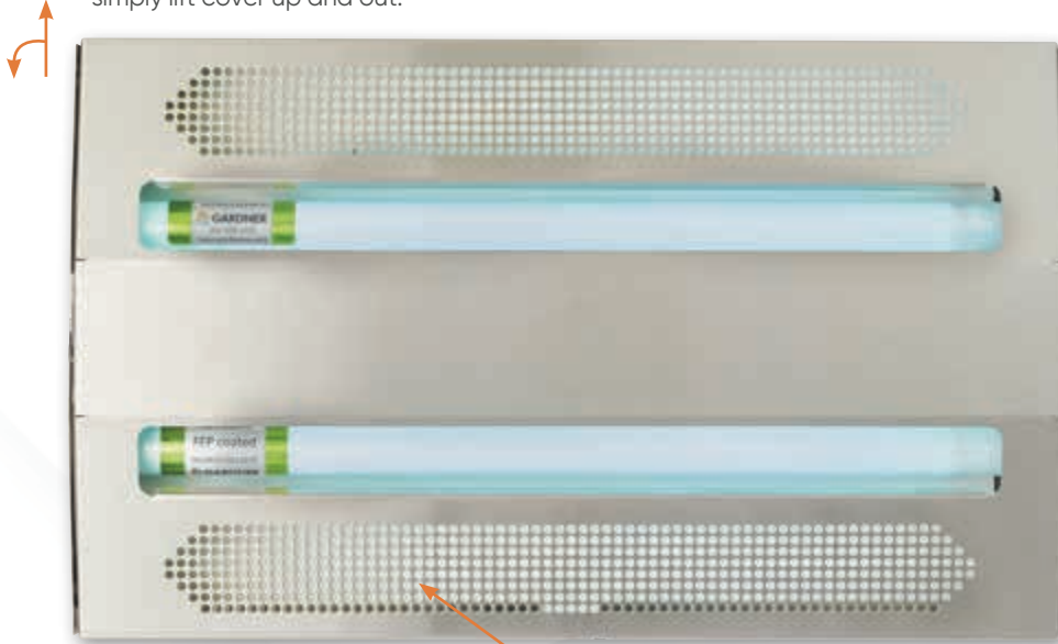
attractive cover conceals insects while maintaining effectiveness

easy to open and close. no latches. simply lift cover up and out.