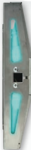
2.5" slim width