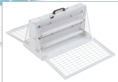
360° of light emission