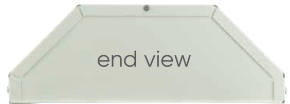
end view designed for corner mount positions