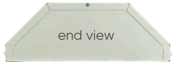
end view designed for corner mount positions